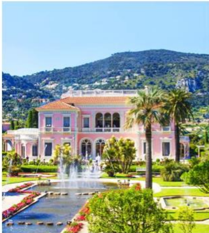
9 Days • 12 Meals: 7 Breakfasts, 2 Lunches, 3 Dinners

HIGHLIGHTS... Nice, Food Tour & Tasting, Nice Flower Market, Monaco, Monte Carlo, Choice on Tour: Monte Carlo Panoramic Tour or Monaco's Oceanographic Museum, Grasse, Fragonard Perfumery Workshop, Cannes, Wine Tasting, Villa Ephrussi de Rothschild, St. Paul de Vence